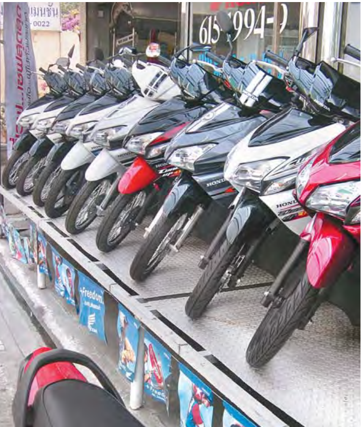
Though migrant workers cannot register motorbikes, many are allowed to purchase them.