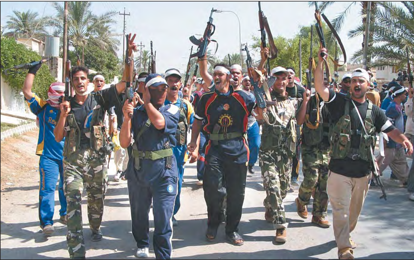
Members of a Sunni insurgent group now aligned with US forces in Iraq celebrate after conducting a raid in which some 15 suspected al-Qaeda members were arrested.

the West. However, in Bosnia, Chechnya, Afghanistan and now Iraq, the Islamist internationalist groups have been unsuccessful in diverting local and national conflicts, playing only the role of auxiliaries. The key actors of the local conflicts are the local actors: the Taliban in Afghanistan, the different Sunni and Shia groups in Iraq, Hezbollah in Lebanon. These groups are not under the leadership of al-Qaeda. Al-Qaeda has only been able to implant foreign volunteers, who usually do not understand local politics, and finds support among local populations only as long as they fight a common enemy, such as American troops in Iraq. But their respective agenda is totally different: Local actors, Islamist or not, want a political solution on their own terms. They do not want chaos or global jihad. As soon as there is a discrepancy between "the policy of the worst" waged by al-Qaeda and a possible local political settlement, local actors choose the local settlement. The Bosnians got rid of the radical foreign fighters once they achieved their independence; the Taliban rank and file refused to die for al-Qaeda when the Western