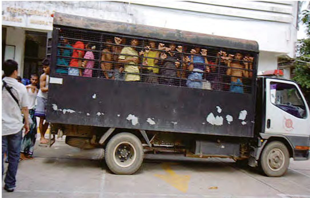
TIGHT SQUEEZE: Illegal immigrants being placed aboard a truck at Ranong Immigration in 2008, prior to being repatriated.

One young woman, aged 17, said that she had been obliged to work at the age of 13 as a prostitute in a karaoke bar, selling sex for 350 baht a time, with 125 baht going to her "owner" and 100 baht going to a corrupt Immigration officer. The karaoke bar, she says, is owned by a local policeman.