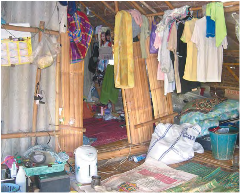
A migrant workers' home. Low wages make finding shelter difficult.

Saowalee is one of the many simple villagers with rudimentary education who have found passion in seeking environmental and social justice. They have read everything related to the project, even the old EIA for the Prachuab Port, which was built to accommodate the steel mill. They found the old EIA contains some inaccura-